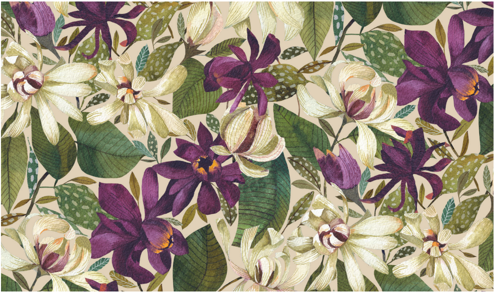
24847-12 | Packed Floral | Beige Multi