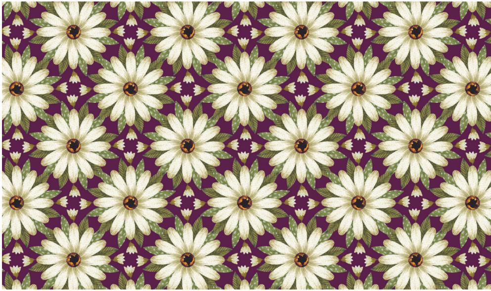
24849-29 | Geometric | Wine