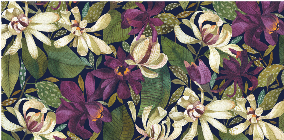
24847-49 | Packed Floral | Navy Multi