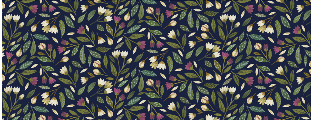
24850-49 | Mini Floral | Navy