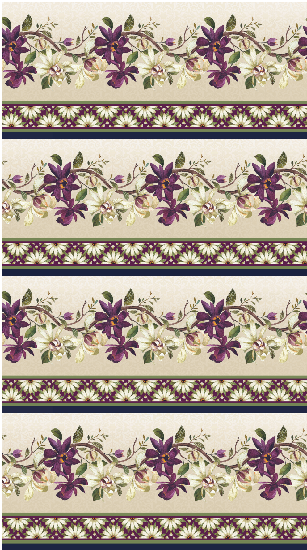
24852-12 | Border Stripe | Beige Multi | 10.75"W x 24" H