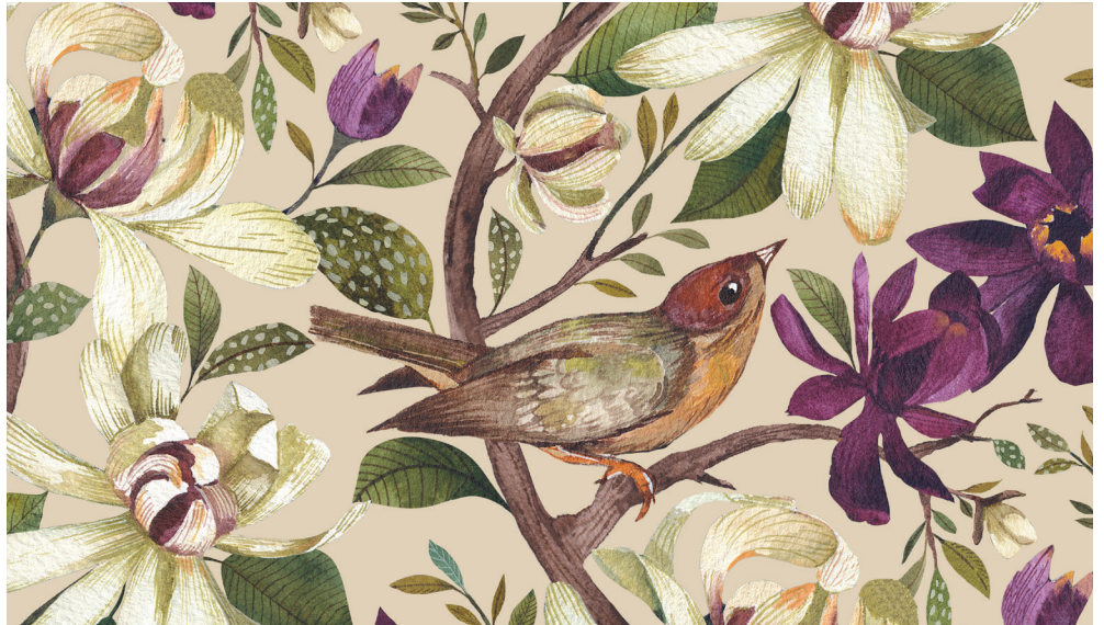
24846-12 | Feature Floral with Birds | Beige Multi | 24" x 24"