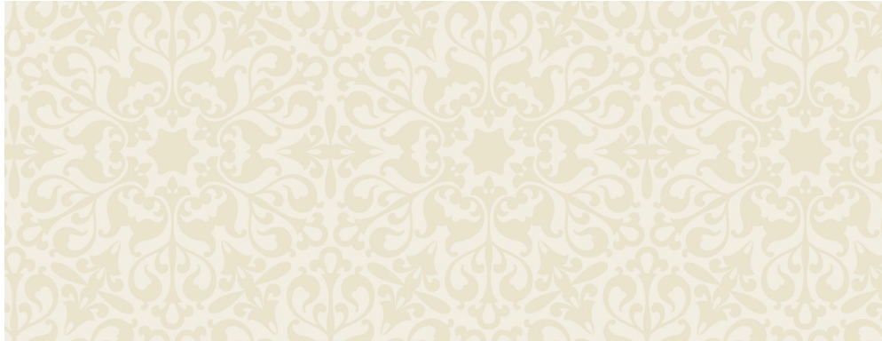
24851-12 | Tonal Medallion | Beige