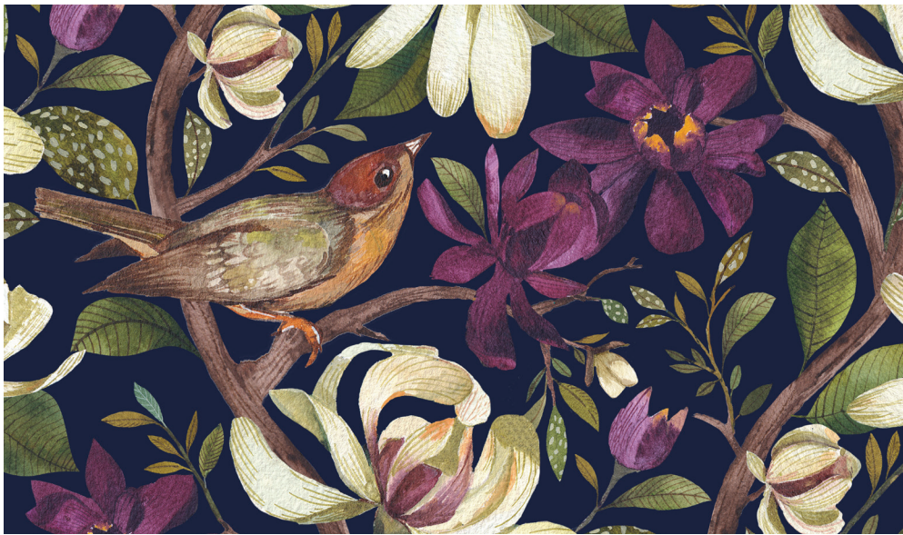
24846-49 | Feature Floral with Birds | Navy Multi