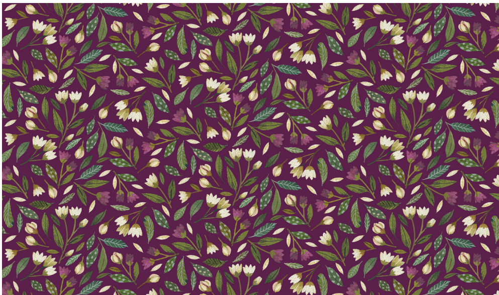
24850-29 Mini Floral-Wine