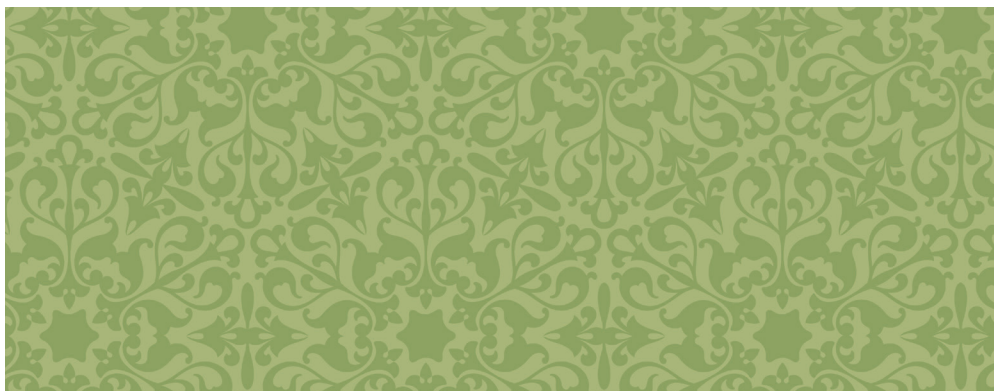
24851-74 | Tonal Medallion | Green