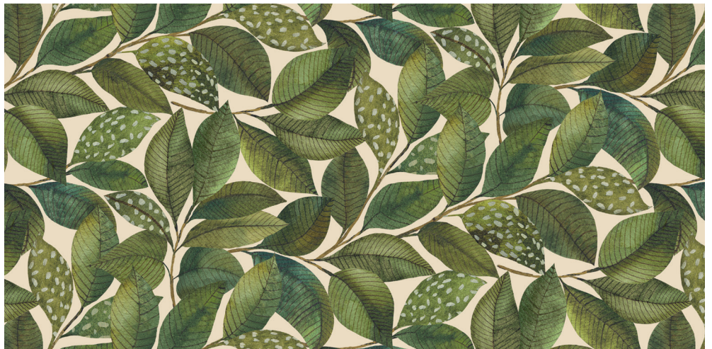
24848-12 | Leaves | Beige