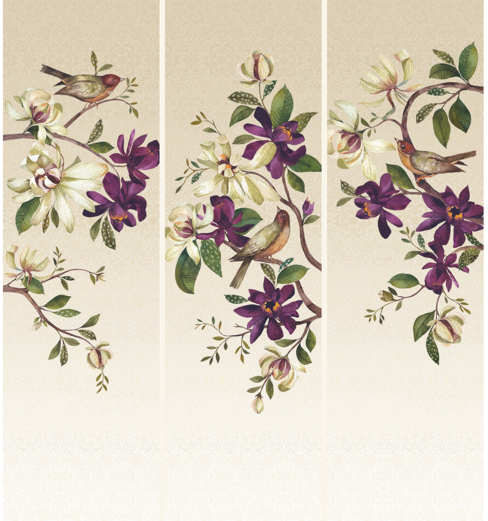
DP24845-12 | Triptic Panel | Beige Multi | 36"W x 43"H